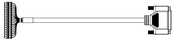
8B Backpanel Interface Cable